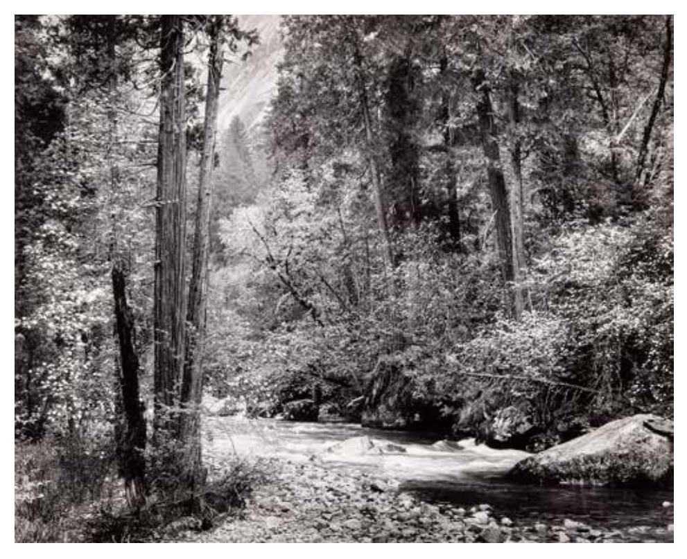
Tenaya Creek, Yosemite Valley, California, 1948.

relationship of photography with reality. This concept is analyzed by Krauss in La Photographique (1990) where she addresses how photography is usually wrongly considered according to criteria that are typical of other forms of art. Photography is commonly studied as an "icon", an image connected with reality according to a principle of resemblance and likeness. By considering photography as an icon it is studied according to aesthetic principles such as focus, light, composition, and originality of the subject. However, the iconic element of photography, according to Krauss, is not its essential one. This is because photography, differently from other kinds of art, presents a peculiar relationship with reality. Photography's relationship with the world is not one of presenting an interpretation of it based on resemblance, like in the case of traditional painting, but instead becomes connected with reality according to an "indexical" relationship in a similar way as the readymade. Photography presents reality in itself in a similar way as Duchamp presented